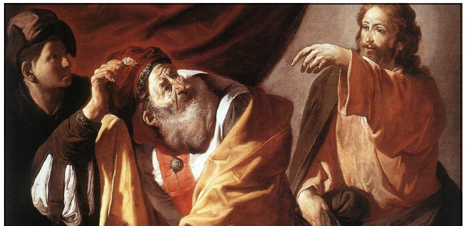
Terbrugghen's 'The Calling of St. Matthew'

The test of our lives lies in this - in the word that we leave behind us. Each life is a word, each one of us is the revelation of a faith or a futility. S. Matthew left a Gospel behind him. Matthew the publican revealed what his life might have been if Jesus had never come into it; S. Matthew the martyr-evangelist revealed what meeting with Jesus could mean.