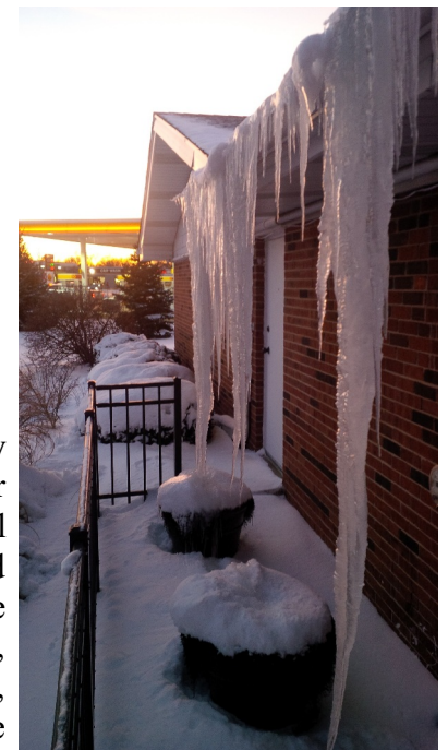
All Saints church rear entry

When Spring finally does arrive, the winter of 2013 and 2014 will be one for the record books! Between the sub-zero temperatures, bitter cold winds, snow and ice no one has escaped its effects.