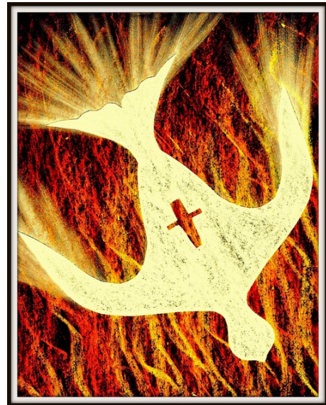
The fiery power of the Holy Spirit descending to Earth

Tell people about us – there are many fellow Christians out there who are hurting and are feeling both hopeless and lost.